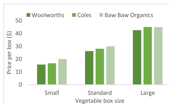
Figure 1. Price comparison between Baw Baw Organics and local supermarkets.

The greatest difference in price was found when comparing the small vegetable box. Baw Baw Organics offered a box for $20 compared to less than $16 at the cheaper supermarket. The large boxes were all similar prices with only $2.43 (5.4%) difference between Woolworth and the food hub. Coles was $0.05 more expensive, even considering not all produce was organic.