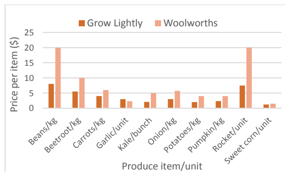
Figure 1. Price comparison of organic produce available at Grow Lightly and Woolworths.

Out of the 38 items audited roughly a quarter (26%) were available in an organic variety at Woolworths.